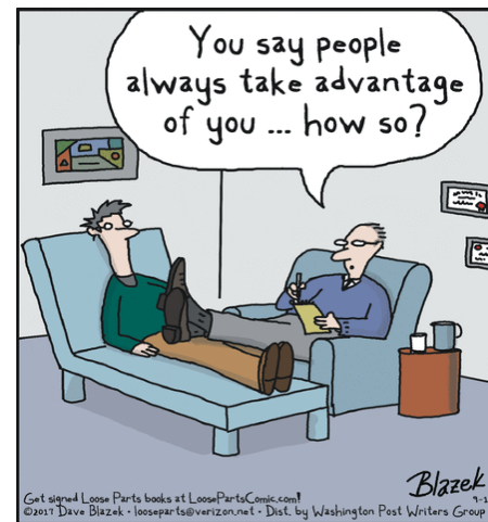
Get signed Loose Parts books at LoosePartsComic.com

Please take a look at our Website https://Kilaveneyparish.ie